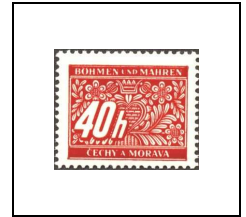
40 h 5