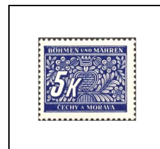
5 k 12