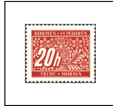
20 h 3