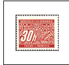
30 h 4