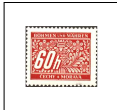
60 h 7