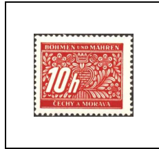
10 h 2