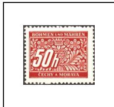
50 h 6