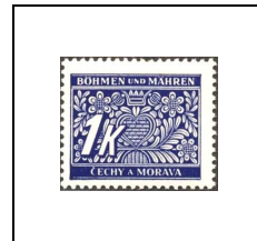
1 k 9