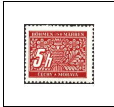
5 h 1