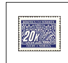
20 k 14