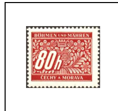
80 h 8