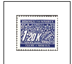
1 k 20 10